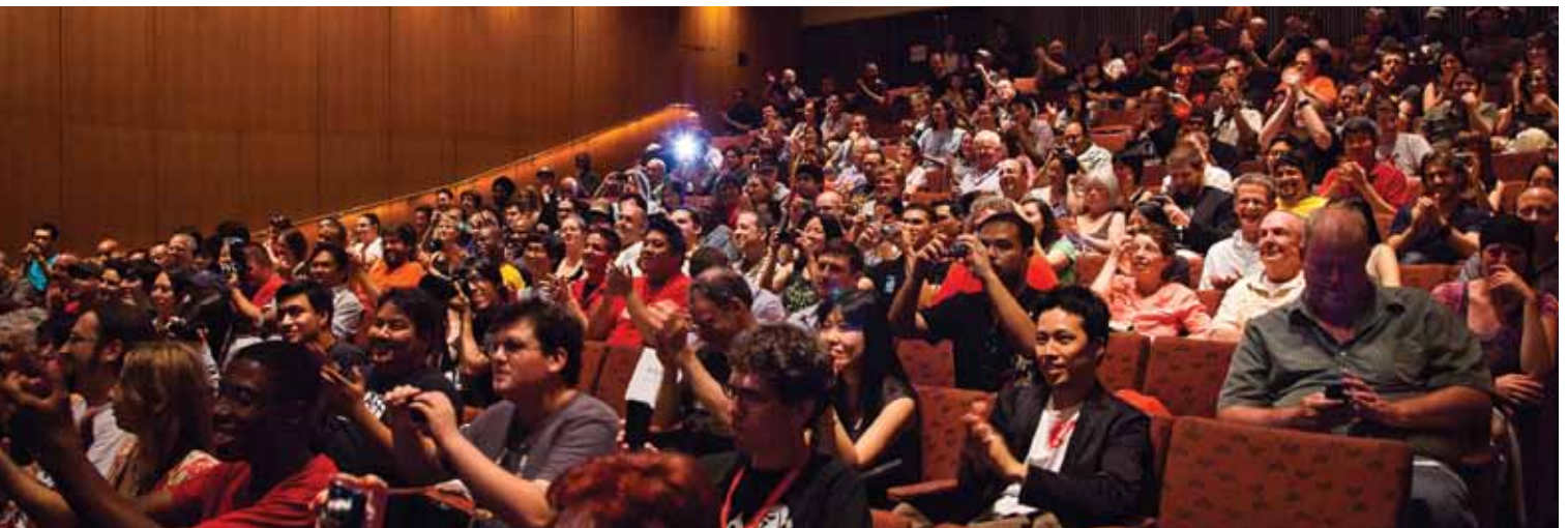
Opposite page (top to bottom): An after party at JAPAN CUTS 2011. © Ayumi Sakamoto. Waiting on line for one of the 32 films screened at JAPAN CUTS 2011. © Ayumi Sakamoto. CONCERT FOR JAPAN. © George Hirose. This page: Audience at a post-screening Q&A during JAPAN CUTS 2011. © Ayumi Sakamoto.